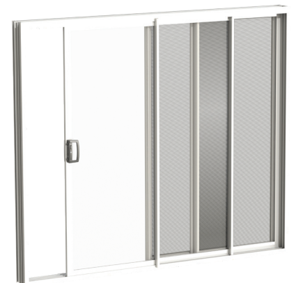
FSS Stacker Configuration